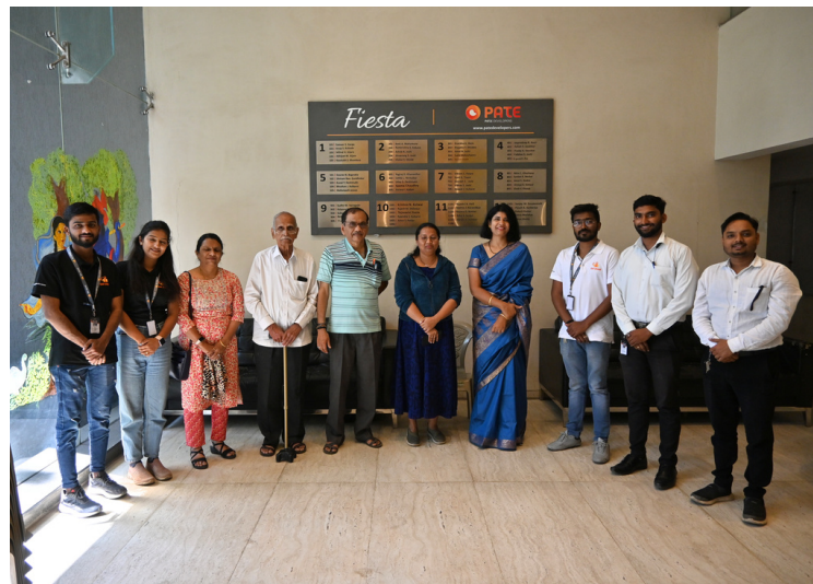
Fiesta Apartment Baner, Pune

In our recent initiative, we organized a drive through our office to aid an apartment in its transformation into a housing society. The main focus of the event was a signature drive, streamlining essential paperwork. The dedicated team from Dear Society actively engaged in the process, going beyond by visiting the client's location to ensure a hassle-free experience. This joint endeavor highlights our commitment to assisting