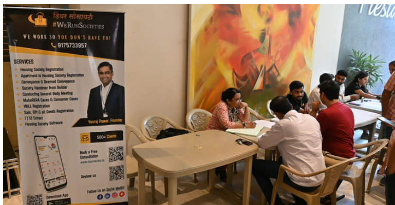
Team visit at client location

communities in navigating the conversion process, ultimately ensuring a smooth and successful transition. We are delighted to have received such positive responses and reaffirm our dedication to delivering exceptional service in all our endeavors. Our goal is to continue supporting communities in their journey towards creating thriving housing societies.